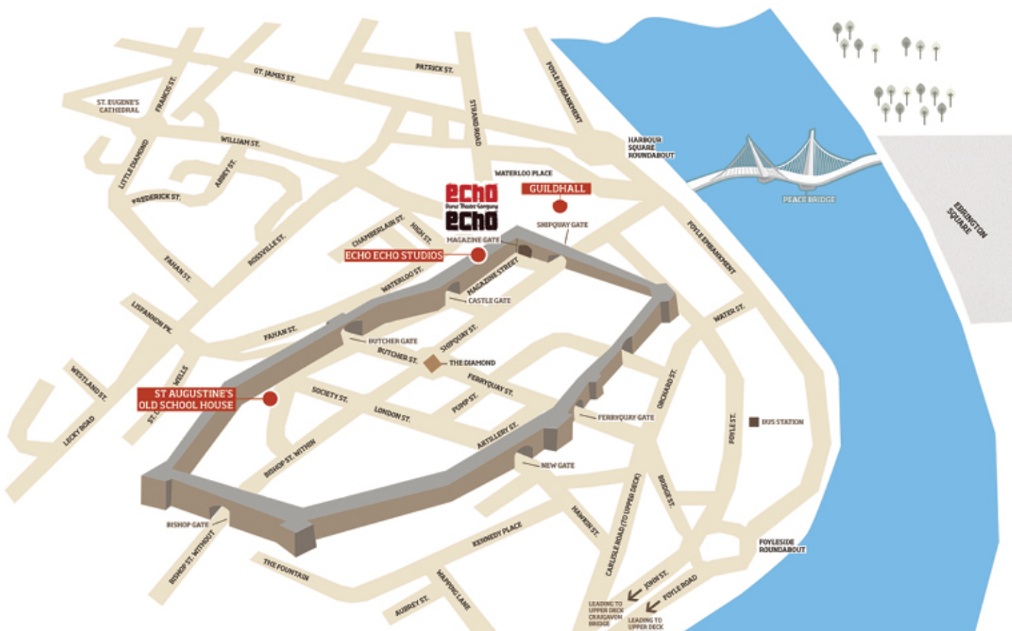
MAP 1: Venues in Derry / Londonderry for the 2019 Echo Echo Festival of Dance & Movement .